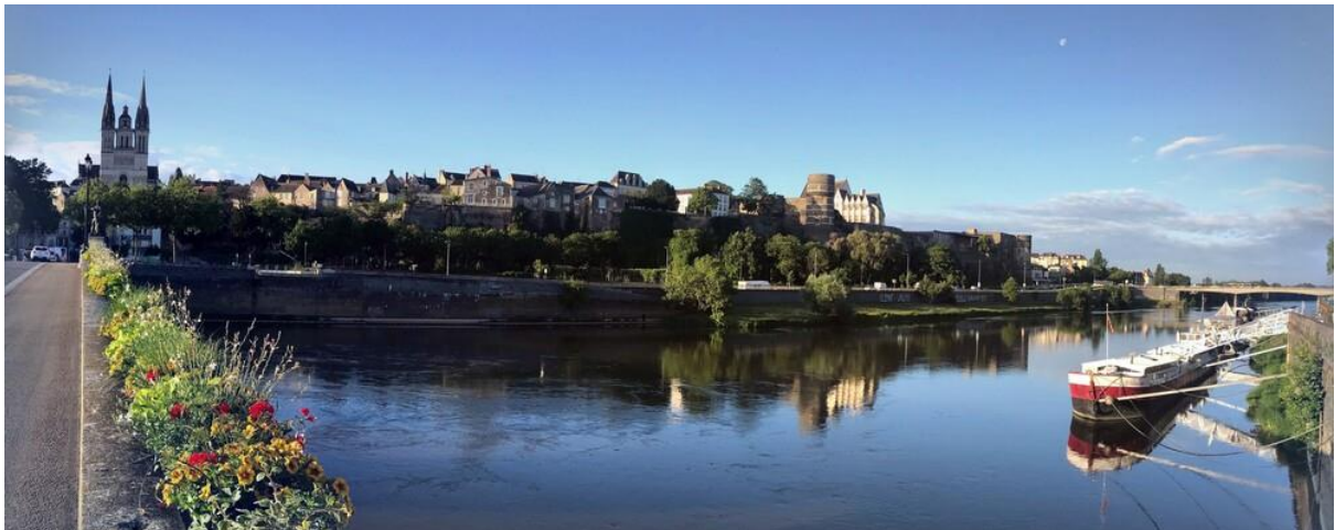
The heart of the Loire Valley - View of the Angers Cité and Château, with the Maine River in the foreground